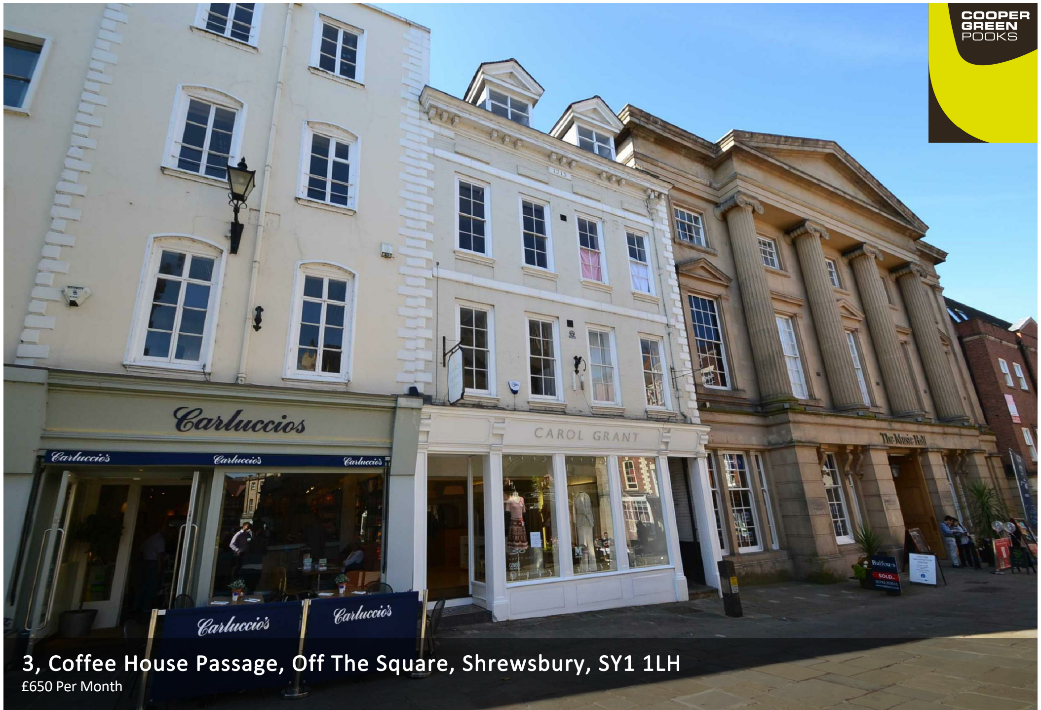
3, Coffee House Passage, Off The Square, Shrewsbury, SY1 1LH £650 Per Month